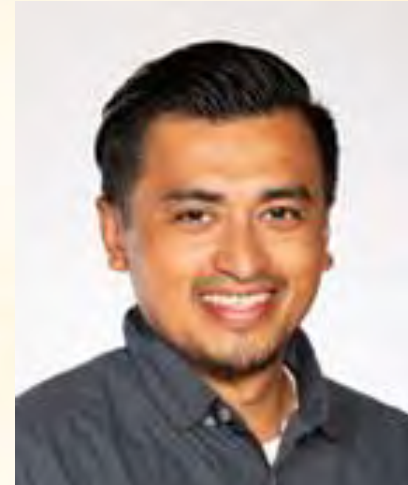
Nelson Contreras SENATOR-AT-LARGE