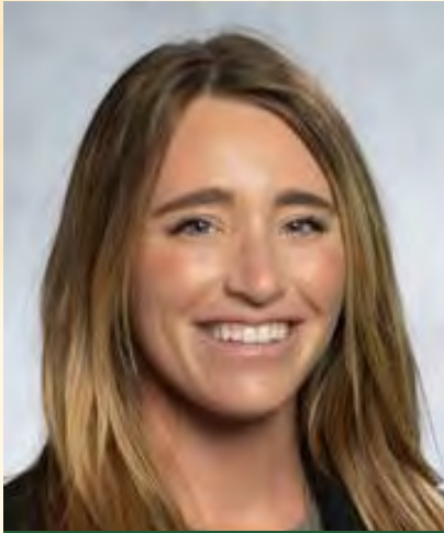
Bre Ritter SENATOR-AT-LARGE