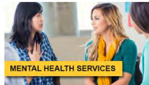
MENTAL HEALTH SERVICES