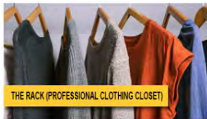
THE RACK (PROFESSIONAL CLOTHING CLOSET)