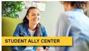
STUDENT ALLY CENTER

The following resource book includes resources available on-campus and throughout our surrounding community. Student Ally Center - Resource Binder [PDF]