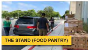
THE STAND (FOOD PANTRY)