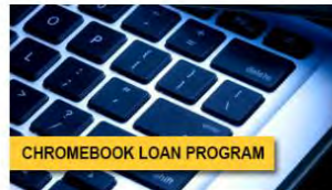
CHROMEBOOK LOAN PROGRAM